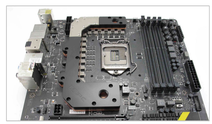
4. Remove the plastic film from the water block and carefully place it into position on the motherboard. You should check the thermal pads are still in position.