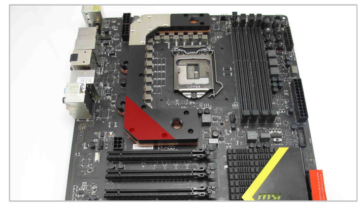
6 . The board is now ready for use. When you first boot it is highly advisable to monitor chipset temperatures. If they appear high you may need to remove and refit the block. Finally you can place the optional XSPC badge on the position marked above in red.