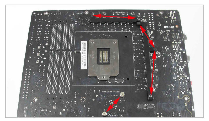
1. Turn the board over and remove the six screws highlighted above. Keep these to one side, they will be needed in step 5.

The installation process below is shown without the tubing connected. This has been done so the installation process can be seen clearly. All water cooling components should be connected and leak tested prior to installation into a PC.