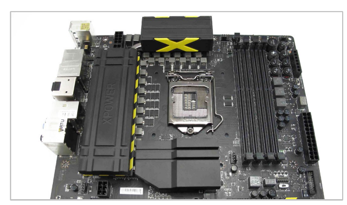
2. Turn the board back over and slowly remove the stock heat sink from the board. You should be careful not to damage any components on the board.