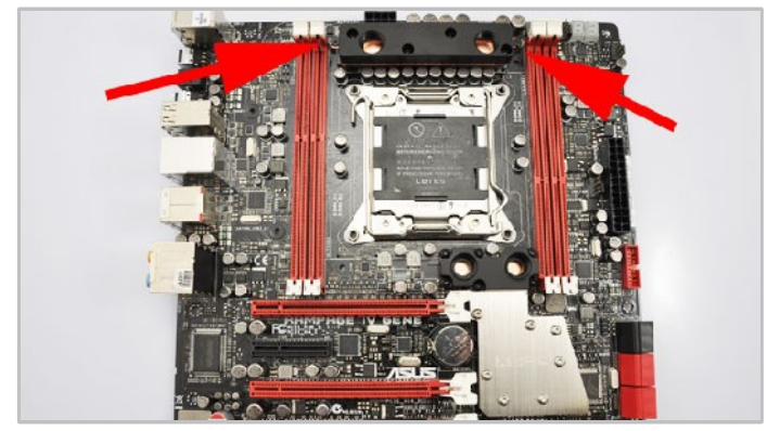
4. Remove the film from the base of the blocks and place them in the positions above. Attach the Vreg waterblock carefully using the original screws. Over tightening or unevenly tightening the screws could damage the motherboard.

(1.Blue Pad, 2.Grey Pad, 3.Thermal Paste).