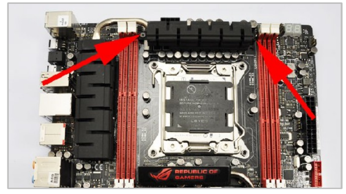
1. Remove the highlighted screws on the front of the motherboard and carefully remove the stock Vreg heatsink. Keep the screws for later.

The installation process below is shown without the tubing connected. This has been done so the installation process can be seen clearly. All watercooling components should be connected and leak tested prior to installation into a PC.