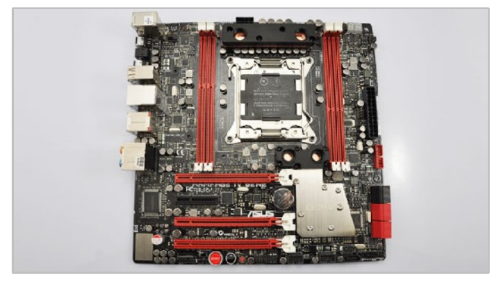
6. When first starting the PC after installation it's advisable to monitor the temperatures. If they appear higher than expected you may need to reseat the blocks.