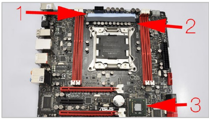
3. Clean the old thermal paste from the chipset then apply fresh thermal paste to the chipset and place the two thermal pads on the position marked at the top of the board.

(1.Blue Pad, 2.Grey Pad, 3.Thermal Paste).