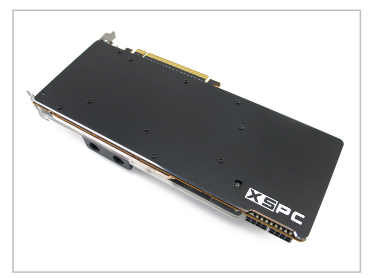
4 . The card is now ready for use. When you first boot it is advisable to use monitoring software to check the core temperature. If the temperature is high you will need to remount the block.