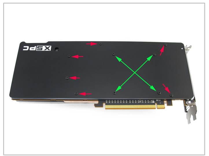
3. Place the backplate onto the card, making sure the front thermal pads and washers stay in place. Now attach the backplate, starting with the four screws marked in green. Do not over tighten the screws as this may bend the card and cause permanent damage.

2. Remove the film from both sides of the thermal pads and place them on the location shown above. Place the red washers over the screw holes shown above.