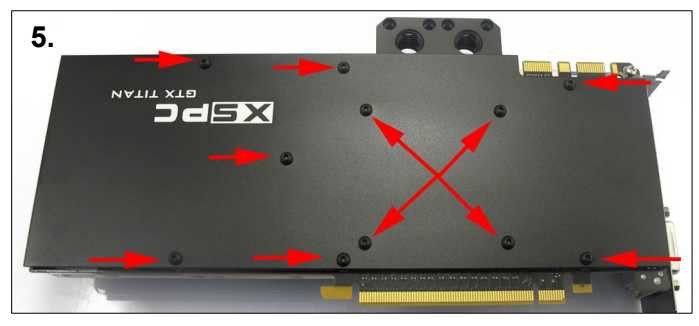
5 . Place the backplate on the back of the card and attach it using the black M3 screws. You should start with the four screws behind the GPU.

The card is now ready for use. When you first boot it is advisable to use monitoring software to check the core temperature. If the temperature is high you will need to remount the block.