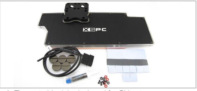
1. The waterblock is designed for SLI setups, so you can fit the G1/4" fittings to multiple sides of the block. Decide which configuration is best for your system.