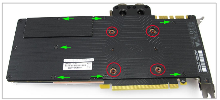
12. Place the waterblock on the card to line up the screw holes and then flip it over, making sure the thermal pads stay in place. First fit the M2.5 screws and washers (marked in red). Finally fit the original screws to attach it (marked in green). You should gradually tighten each screw to apply even pressure...