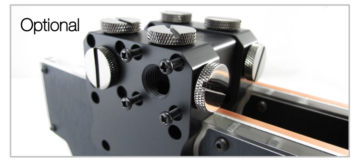
If you are using cards in crossflow you can use the optional SLI flow connector to bridge the two cards. This should be done after step 12.