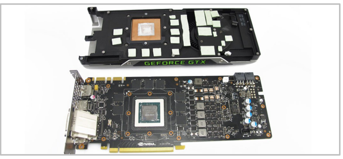
8. Turn the card back over and carefully remove the heat sink and fan. Now the card and heat sink are separated detach the fan power cable from the fan header.