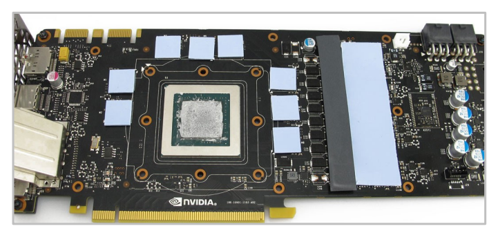
11. Remove the tape from both sides of the thermal pads. Place the blue and grey pads on the ten positions shown above and finally apply thermal paste to the GPU core.