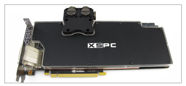
13. Do not over tighten the screws as this may bend the card and cause permanent damage. The card is now ready for use. When you first boot it is advisable to use software to check the core temperature. If the temperature is high you will need to remount the block.