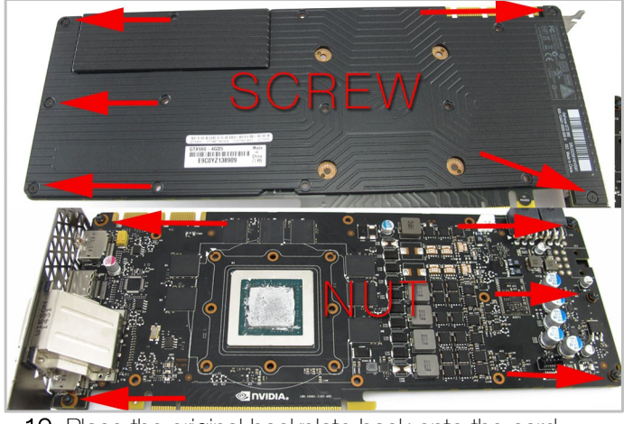
10. Place the original backplate back onto the card. Now use 5 of the original backplate screws and the 5 provided nuts to attach the backplate to the card. This must be done before the block is fitted.