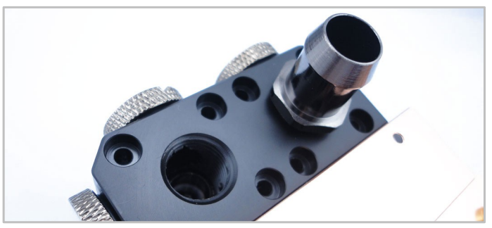
3. Attach your chosen fittings to the G1/4" ports. Make sure to attach one of the left and one on the right side. Flow direction is not important.