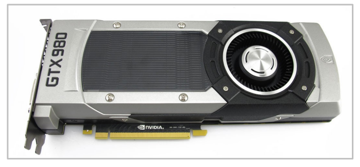
6. Before handing the card you should take precautions to avoid static damage. Remove the GTX 980 card from the box ready for installation.