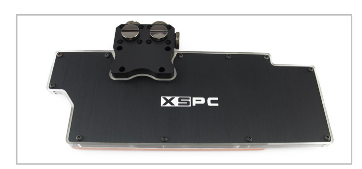
4 . The block is now ready to be connected to the other watercooling components for leak testing.