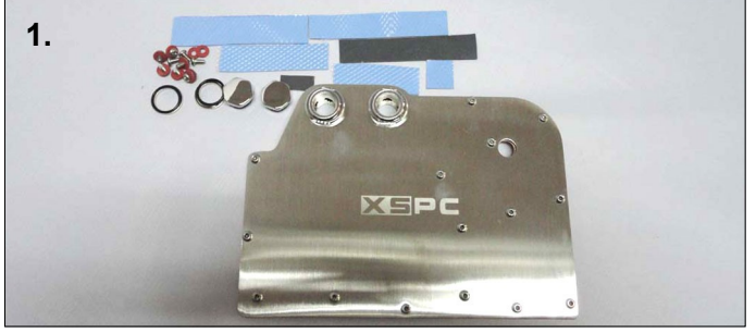
1. The waterblock is designed for SLI setups, so you can fit the G1/4" fittings to either side of the block. Decide which configuration is best for your system.

Note: This waterblock is only suitable for reference design GTX580 cards. If you are unsure if your card if a reference design GTX580 contact us prior to installation to make sure.