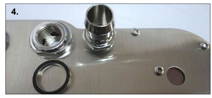
4. If you are using G1/4" barbs/fittings with a long thread you will need to use the supplied rings to avoid blocking the flow. Attach the barbs to your chosen ports using an adjustable spanner. Make sure the o-rings are fully compressed.