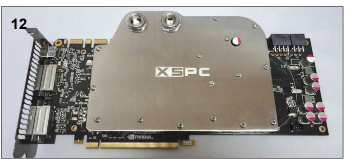
12 . The card is now ready for use. When you first boot it is advisable to use ATItool or other software to check the core temperature. If the temperature is high you will need to remount the block.