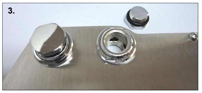
3 . Use the provided plugs to block the unused G1/4" ports. Make sure the o-rings are fully compressed.