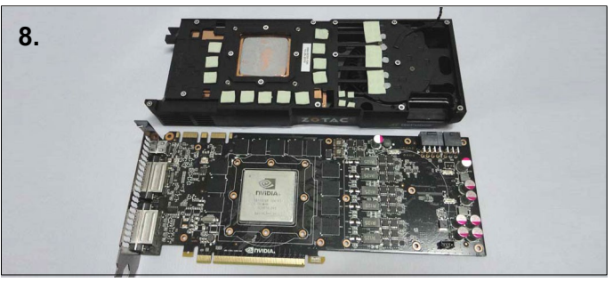
8 . Turn the card back over and carefully remove the heatsink and fan. Now the card and heatsink are separated detach the fan power cable from the fan header.