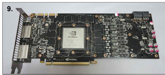
9. Clean the thermal paste from the GPU core ready for installation. Remove any residue left from the thermal pads.