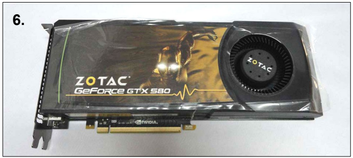
6 . Before handing the card you should take precautions to avoid static damage. Remove the GTX580 card from the box ready for installation.