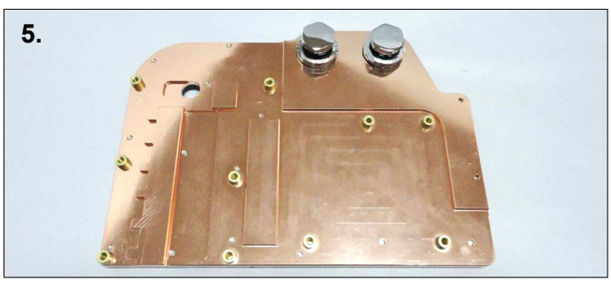
5 . The block is now ready to be connected to the other watercooling components for leak testing.