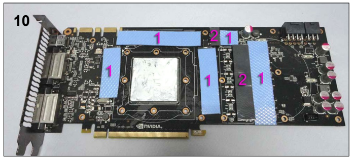
10 . Remove the tape from both sides of the thermal pads. Place the blue pads on positions marked 1 and grey pads on positions marked 2. Next apply thermal paste to the GPU core.