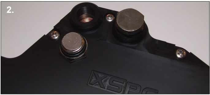
2. Use the provided plugs to block the unused G1/4" ports. Make sure the o-rings are fully compressed.