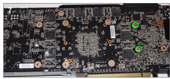
7. Carefully remove the nvidia backplate and unscrew the two screws highlighted above.