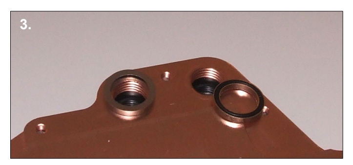
3 . If you are using G1/4" barbs/fittings with a long thread you will need to use the supplied rings to avoid blocking the flow.