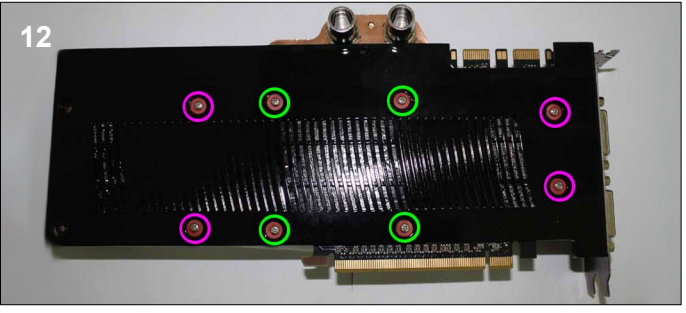
12 . Finally replace the nvidia backplate and use the 8 provided screws and washers to secure the waterblock to the card. It is best to start with the 4 screws around the GPU to apply the correct pressure to the core. Do not over tighten the screws as this may bend the card and cause damage.