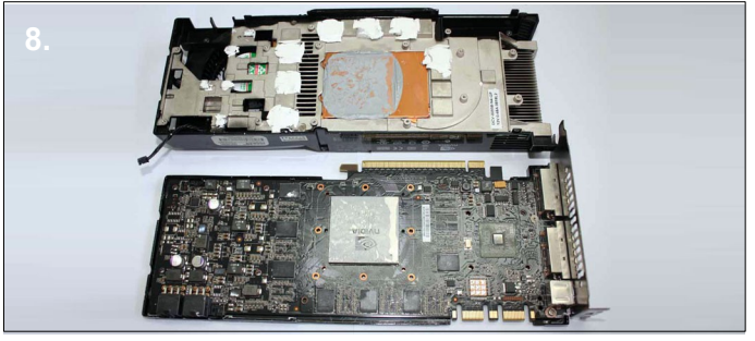
8 . Turn the card back over and carefully remove the heatsink and fan. Now the card and heatsink are separated detach the fan power cable from the fan header.