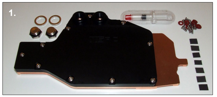
1 . The waterblock is designed for SLI setups so you can fit the G1/4" fittings to either side of the block. Decide which configuration is best for your system.