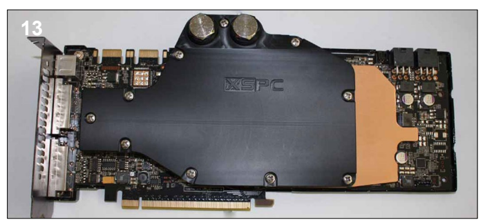
13. The card is now ready for use. When you first boot it is advisable to use ATItool or other software to check the core temperature. If the temperature is high you will need to remount the block.