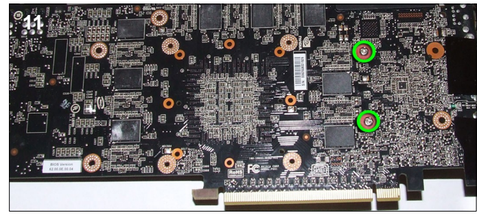
11. With the copper side of the waterblock facing up, place the card over the block and line up the screw holes. Make sure the thermal pads have stayed in place and lightly screw two screws with washers into the block through the holes highlighted above and replace the nvidia backplate.