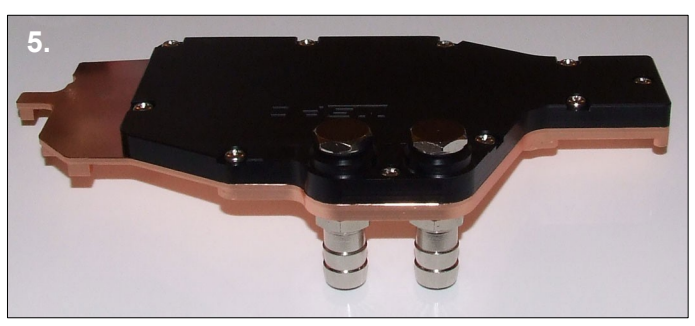
5 . The block is now ready to be connected to the other watercooling components for leak testing.