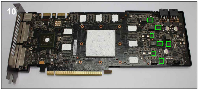
10 . Remove the tape from both sides of the thermal pads and place them on the locations marked in the photo above. Next apply thermal paste to the memory chips, chipset and the GPU core.