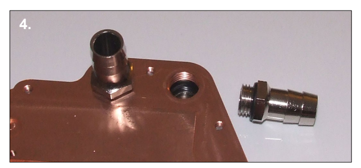
4. Attach the barbs to your chosen ports using an adjustable spanner. Make sure the o-rings are fully compressed.