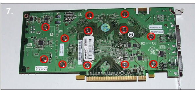
7. Turn the card on its back and remove the 12 screws highlighted above.