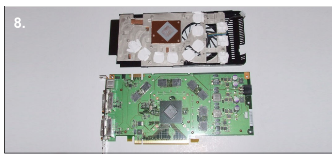
8 . Turn the card back over and carefully remove the heatsink and fan. Now the card and heatsink are separated detach the fan power cable from the fan header.

6 . Before handing the card you should take precautions to avoid static damage. Remove the 9600 card from the box ready for installation.