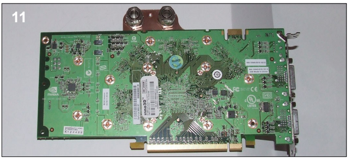
11. With the copper side of the waterblock facing up place the card over the block and line up the screw holes.