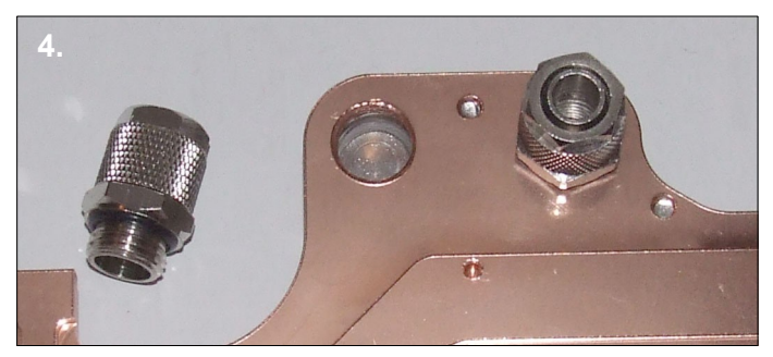
4. Attach the barbs to your chosen ports using an adjustable spanner. Make sure the o-rings are fully compressed.