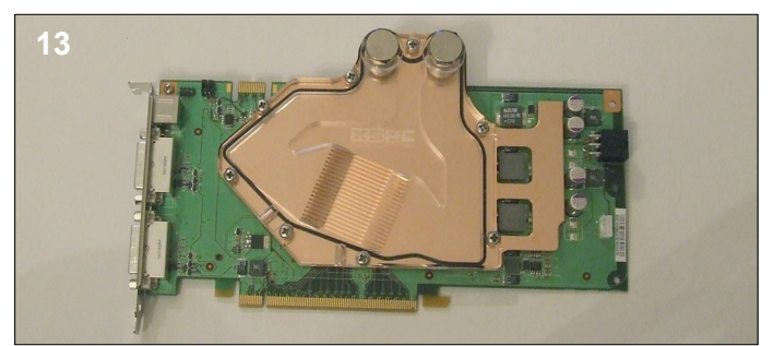
13. The card is now ready for use. When you first boot it is advisable to use ATItool or other software to check the core temperature. If the temperature is high you will need to remount the block.