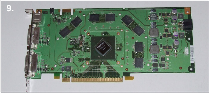
9. Clean the thermal paste from the GPU core ready for installation. Remove any residue left from the thermal pads.