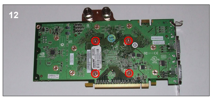
12 . Finally use the 11 provided screws and washers to attach the waterblock to the card. It is best to start with the 4 screws around the GPU to apply the correct pressure to the core. Do not over tighten the screws as this may bend the card.