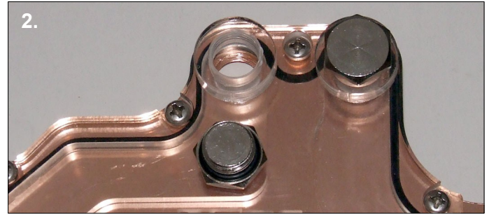
2. Use the provided plugs to block the unused G1/4" ports. Make sure the o-rings are fully compressed.