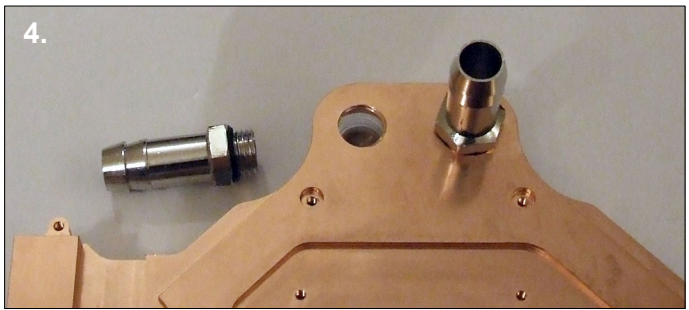
4. Attach the barbs to your chosen ports using an adjustable spanner. Make sure the o-rings are fully compressed.