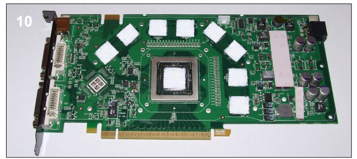
10 . Remove the tape from both sides of the thermal pads and place them on the mosfets to the right of the card. Next apply thermal paste to the memory chips and the GPU core.

8 . Turn the card back over and carefully remove the heatsink and fan. Now the card and heatsink are separated detach the fan power cable from the fan header.