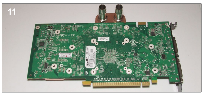
11. With the copper side of the waterblock facing up place the card over the block and line up the screw holes.

9. Unscrew the two screws highlighted above and remove the black aluminium bar. Clean the thermal paste from the GPU core ready for installation. When using thermal pads remember to remove the tape from both sides.