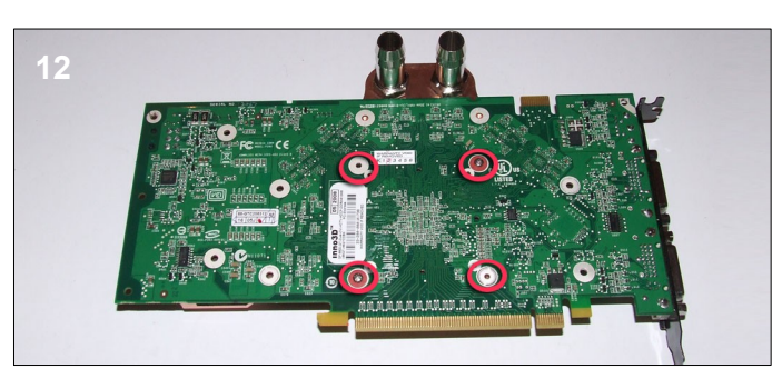
12 . Finally use the 11 provided screws and washers to attach the waterblock to the card. It is best to start with the 4 screws around the GPU to apply the correct pressure to the core. Do not over tighten the screws as this may bend the card.