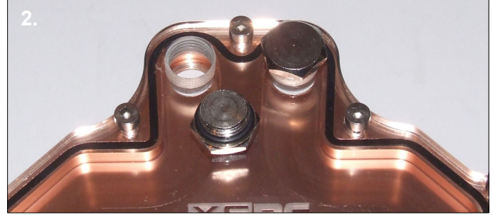
2. Use the provided plugs to block the unused G1/4" ports. Make sure the o-rings are fully compressed.