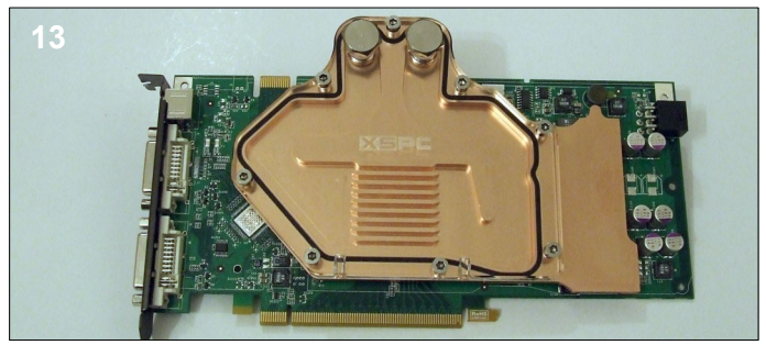
13. The card is now ready for use. When you first boot it is advisable to use ATItool or other software to check the core temperature. If the temperature is high you will need to remount the block.