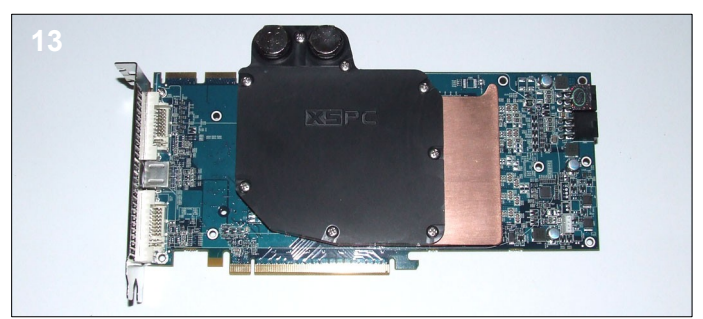
13. The card is now ready for use. When you first boot it is advisable to use ATItool or other software to check the core temperature. If the temperature is high you will need to remount the block.