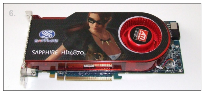
6 . Before handing the card you should take precautions to avoid static damage. Remove the 4870 card from the box ready for installation.