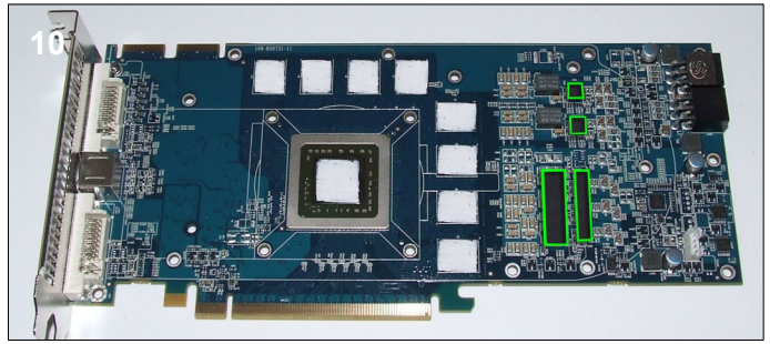
10 . Remove the tape from both sides of the thermal pads and place them on the highlighted locations on the right of the card. Next apply thermal paste to the memory chips and the GPU core.