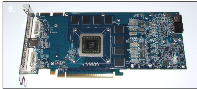
9. Clean the thermal paste from the GPU core ready for installation. Remove any residue left from the thermal pads.