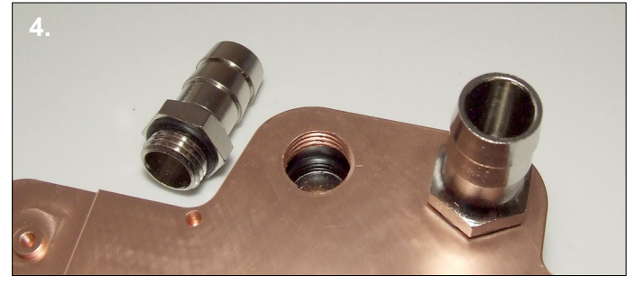
4. Attach the barbs to your chosen ports using an adjustable spanner. Make sure the o-rings are fully compressed.