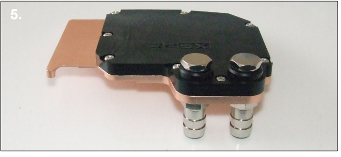
5 . The block is now ready to be connected to the other watercooling components for leak testing.