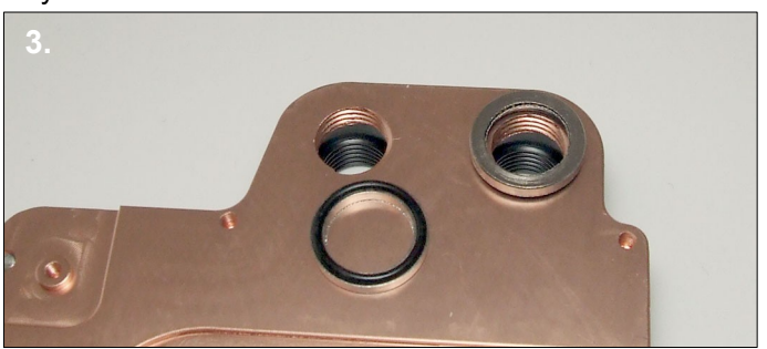
3 . If you are using G1/4" barbs/fittings with a long thread you will need to use the supplied rings to avoid blocking the flow.