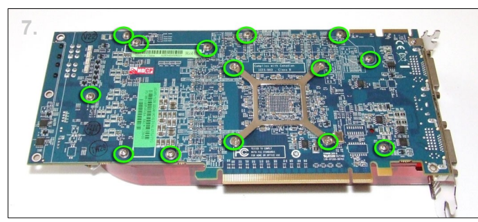
7. Turn the card on its back and remove the 14 screws highlighted above.