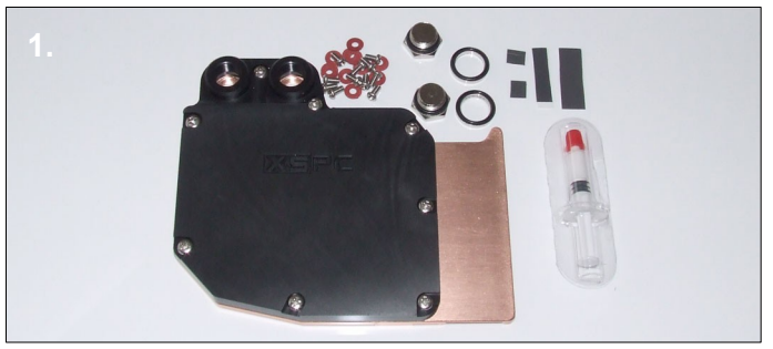
1 . The waterblock is designed for crossfire setups so you can fit the G1/4" fittings to either side of the block. Decide which configuration is best for your system.