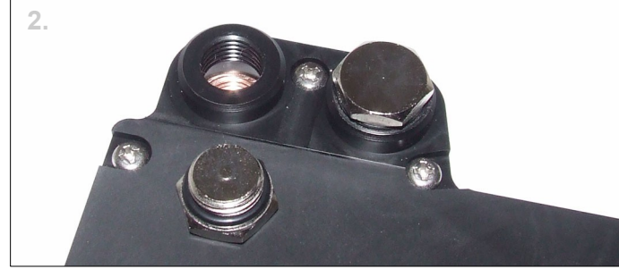
2. Use the provided plugs to block the unused G1/4" ports. Make sure the o-rings are fully compressed.