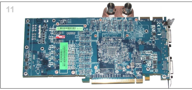
11. With the copper side of the waterblock facing up place the card over the block and line up the screw holes.