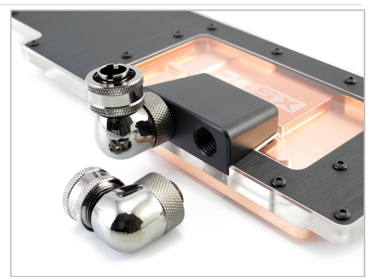
2. The waterblock is designed for use with rotary fittings. Attach your chosen fittings to the inlet and outlet of the block. The water flow can go in either direction.

1 . Check your box contents against the list above before you start the installation process. Now remove the protective plastic film from the block.