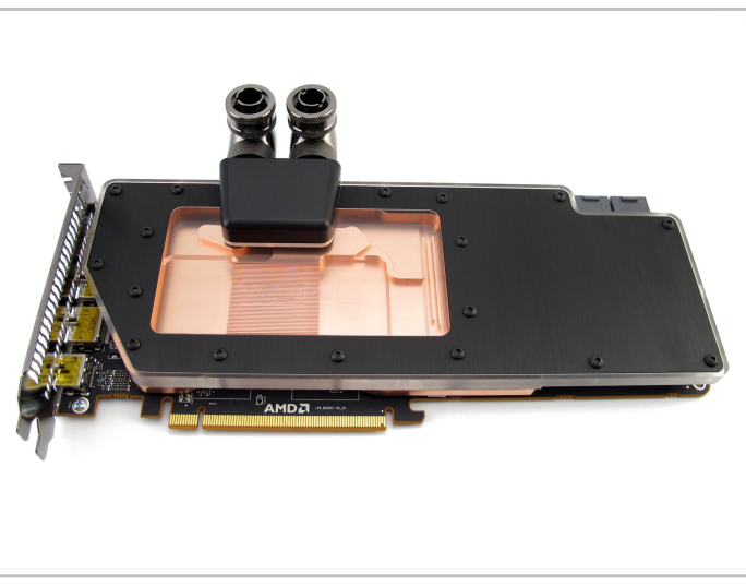
3 . The block is now ready to be connected to the other watercooling components for leak testing.