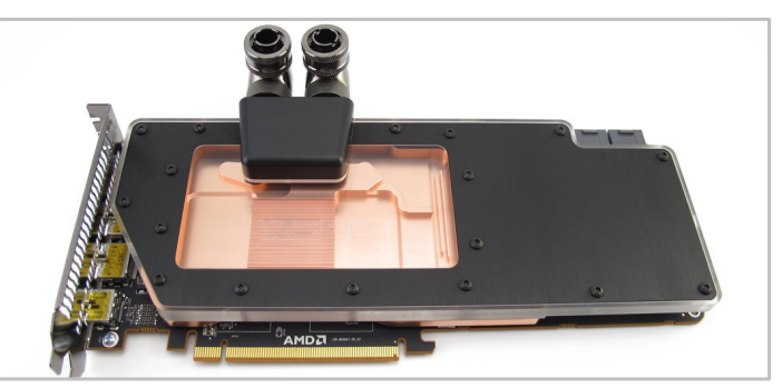
10 . Do not over tighten the screws as this may bend the card and cause permanent damage. The card is now ready for use. When you first boot it is advisable to use software to check the core temperature. If the temperature is high you will need to remount the block.