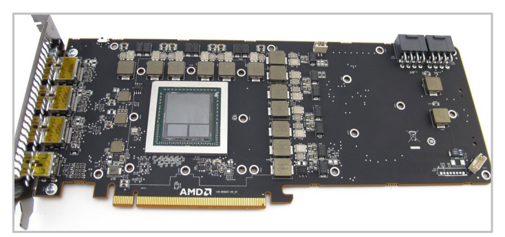
7. Clean the thermal paste from the GPU core and remove any residue left from the thermal pads. Do not attempt to clean any paste left between the core and memory stacks, as this can cause damage.

5. Remove the backplate and remove the 14 screws highlighted above.