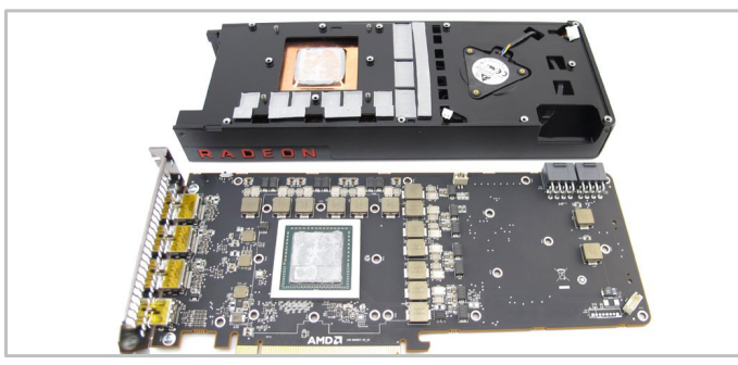
6. Turn the card back over and carefully remove the heat sink and fan. Now the card and heat sink are separated detach the fan power cable from the fan header.

4 . Turn the card on its back and remove the 12 screws highlighted above.