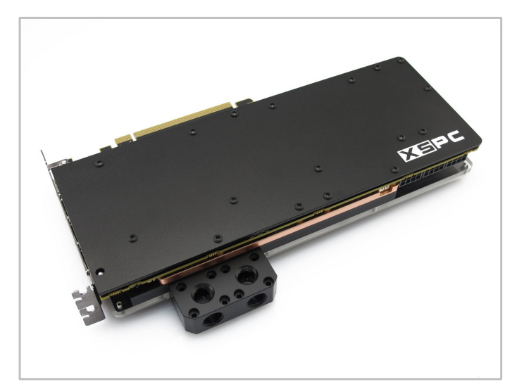
4. The card is now ready for use. When you first boot it is advisable to use monitoring software to check the core temperature. If the temperature is high you will need to remount the block.