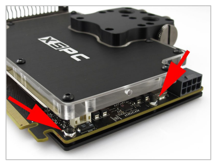
4. Finally turn the card over and secure the screws shown above with the provided nuts.

The card is now ready for use. When you first boot it is advisable to use monitoring software to check the core temperature. If the temperature is high you will need to remount the block.