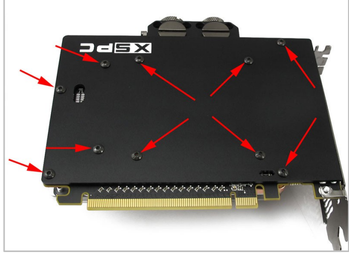
3. Fit the backplate with the provided screws. Do not over tighten the screws as this may bend the card and cause permanent damage.

2. Flip the card over (make sure the front thermal pads stay in place). Place the red washers over the screw holes shown above. Now remove the protective film from both sides of the thermal pads. Place the 1.5mm pad on the position marked in red and the 1mm pad on the position marked in green.