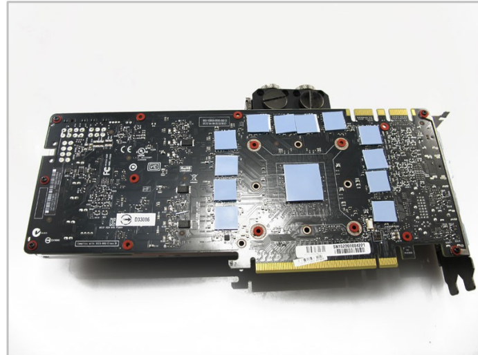
3. Remove the film from both sides of the thermal pads and place them in the locations shown above. Place the red washers over the screw holes shown above.