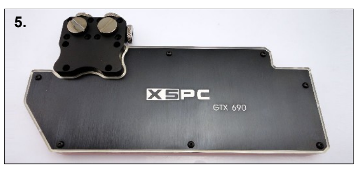
5 . The block is now ready to be connected to the other watercooling components for leak testing.

3 . Attach your chosen fittings to the G1/4" ports. Make sure to attach one of the left and one on the right side. Flow direction is not important.