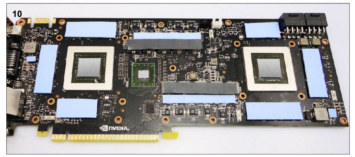
10 . Remove the tape from both sides of the thermal pads. Place the ten blue pads and two grey pads on the positions shown above. Next apply thermal paste to the GPU cores and chipset.