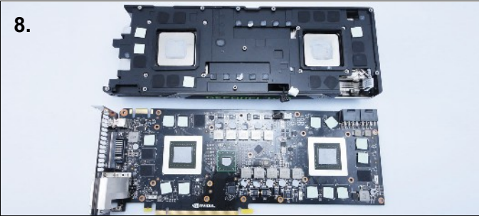
8 . Turn the card back over and carefully remove the heatsink and fan. Now the card and heatsink are separated detach the fan power cable from the fan header.

6 . Before handing the card you should take precautions to avoid static damage. Remove the GTX690 card from the box ready for installation.