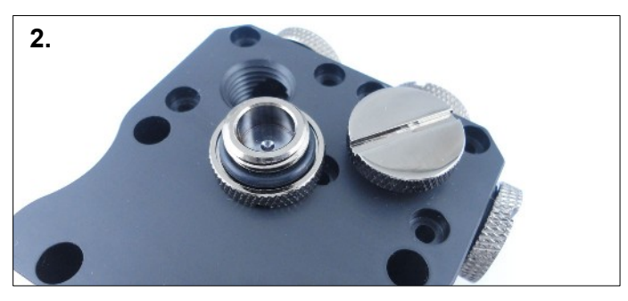
2. Use the G1/4" blanking plugs to block the unused ports.