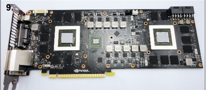
9. Clean the thermal paste from the GPU cores, chipset and remove any residue left from the thermal pads.