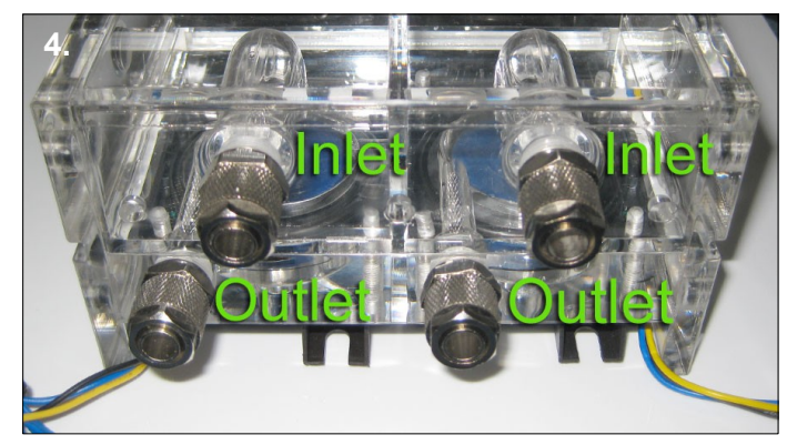
4. Now screw the G1/4" fittings to the inlets and outlets making sure the o-rings are compressed. Push the LED or LED's into any of the three 5mm holes on the back of the reservoir. The pump is now ready to be connected to your other watercooling components and leak tested before being fitted into two 5.25" drive bays.