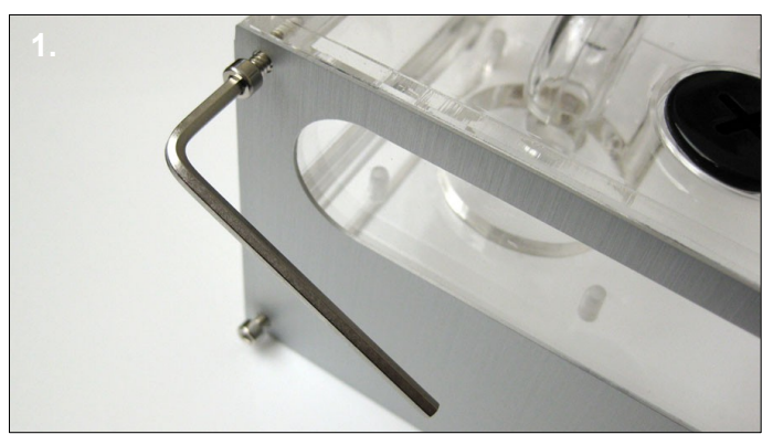
1. Unscrew the 4 screws on the front of the reservoir using the provided allen key. Now place your chosen faceplate on the reservoir and refit the screws.