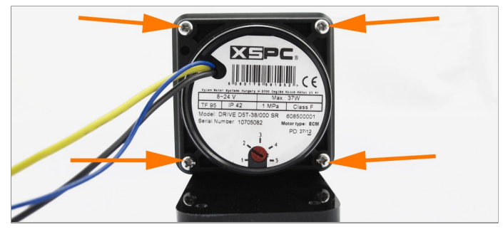
6. Using the plastic bracket, attach the pump to the back of the D5 top. You should gradually tighten the four screws until the o-ring is compressed.

4. Push the plastic bracket over the back of the pump. The circular cut-out on the plastic bracket should be facing the front.