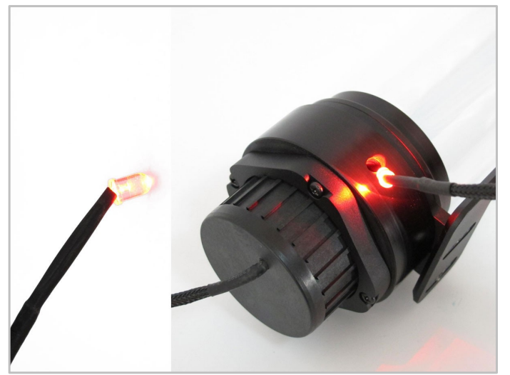
3 . When fitting the LED, slightly kink the LED wire and push the LED into the hole on the base of the reservoir. You might need to twist the LED slightly until it slots into place.

2. To fill the reservoir use a small coin to undo the fill cap and fill the reservoir to the top of the glass. The fill cap can also be used as an inlet with the use of a M20 to G1/4" adapter. The fill cap cannot be used an an outlet.