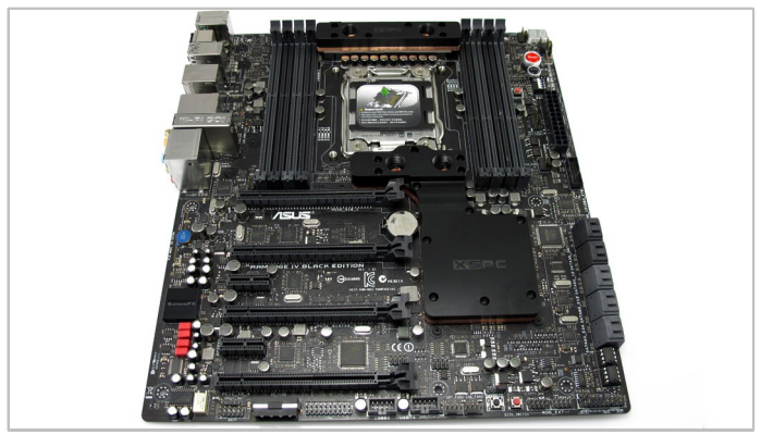
6 . The board is now ready for use. When you first boot it is highly advisable to monitor chipset temperatures. If they appear high you may need to remove and refit the block.