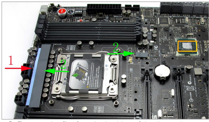
3. Remove the film from both sides of the thermal pads. Place the blue pad on position 1 and the grey pads on positions marked 2. Now apply K2 paste to the chipset.