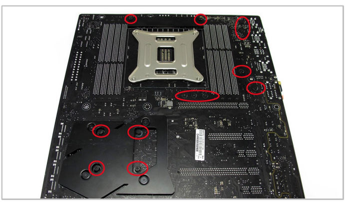
1. Turn the board over and remove the thirteen screws highlighted above. Keep these to one side, they will be needed in step 5.