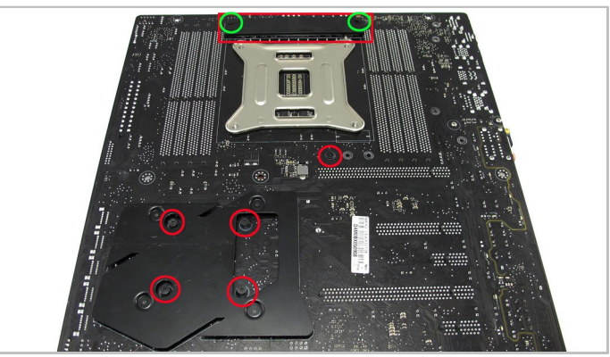
5. With one hand on the blocks, turn the board back over. Refit the five original screws to positions marked in red and the M2x8mm screws and washers to positions marked in green.