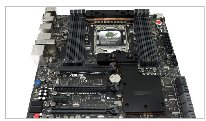
4 . Remove the plastic film from the A and B water blocks and carefully place them into position on the motherboard. You should check the thermal pads are still in position.