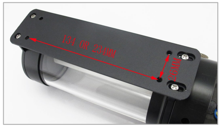
6. To mount the reservoir you will need to drill four holes onto a case panel. You can then attach the reservoir be using the four supplied M4 screws.

4 . The fill cap can also be used as an inlet with the use of a M20 to G1/4" adapter. The fill cap cannot be used an an outlet.