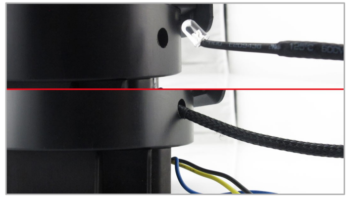
5. Slightly kink the LED wire and push the LED into the hole on the base of the reservoir. You might need to twist the LED slightly until it slots into place.

3. The pump had one outlet and two inlets. Attach the hose fittings to your ports of choice.